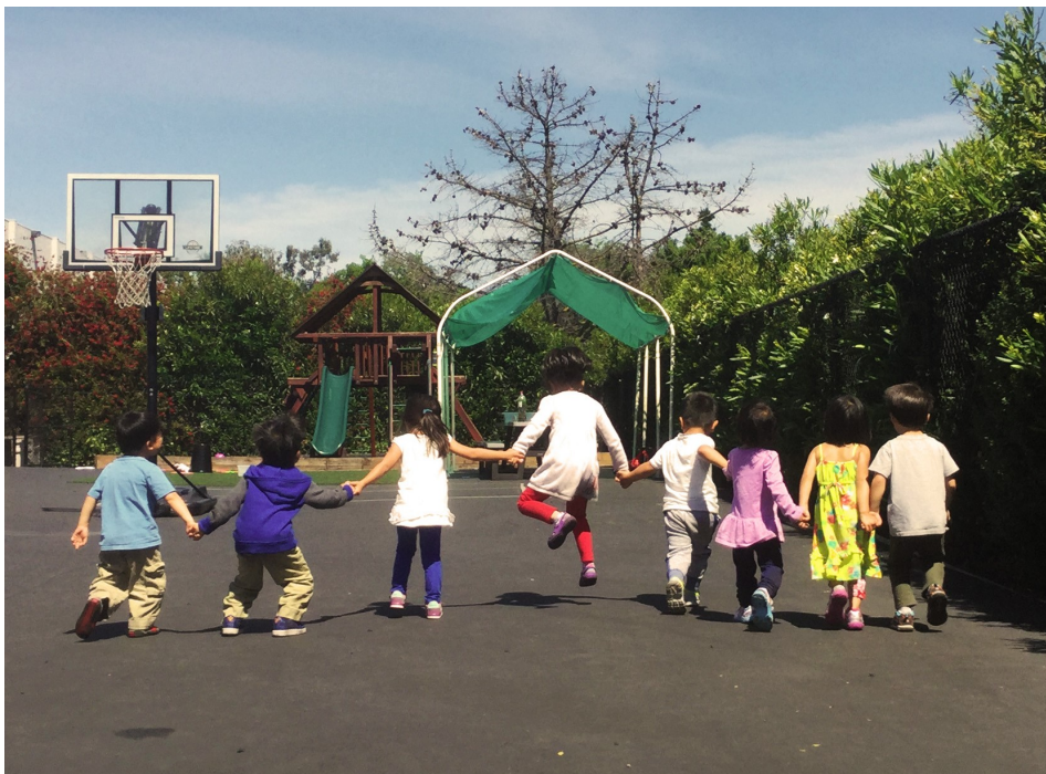
Mustard Seed Learning Center, where individuality takes place.

Our flag has 13 stripes, 13 stripes, 13 stripes, our flag has 13 stripes, in the U.S.A.